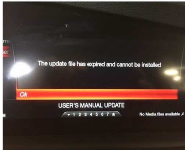
Fig. 1 Update File Error Prompt

Some technicians may experience an error when they attempt to update the User Guide. The radio may prompt an error, “The update file has expired and cannot be installed” (Fig. 1) .