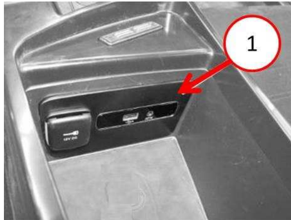
Fig. 4 Location of the USB Port