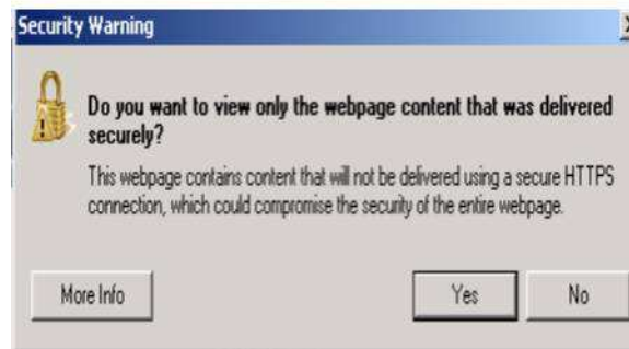
Fig. 2 Security Warning Pop-up

NOTE: The software acquisition requires the deletion of all the files on the USB flash drive before copying the contents of the folder necessary for the update. Copy only the files contained in the folder onto the flash drives, NOT the folder itself.