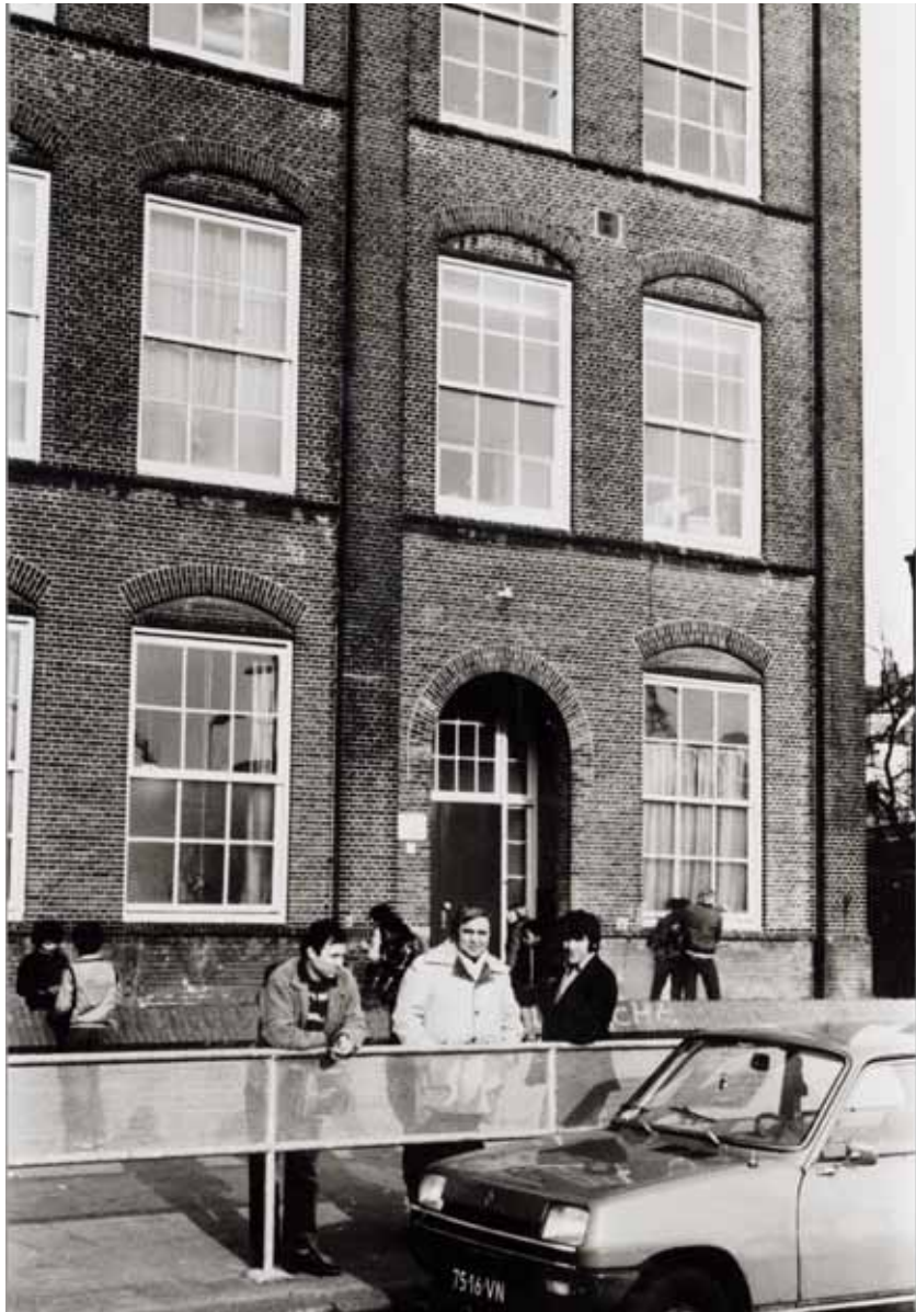
Parents wait for their children outside a Greek concentration school, Utrecht 1985.