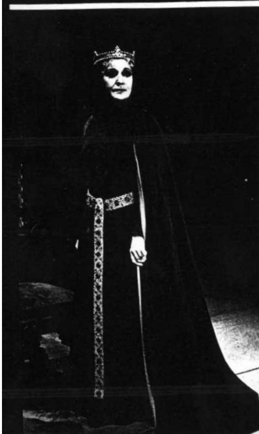
Eileen Herlie Top: Rex Harrison